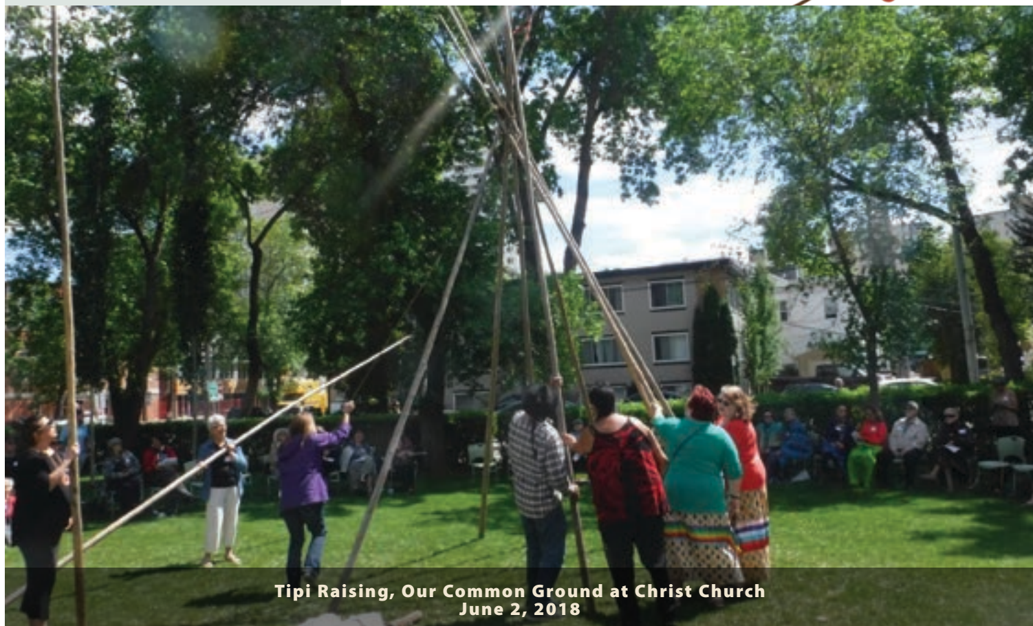
Tipi Raising, Our Common Ground at Christ Church June 2, 2018