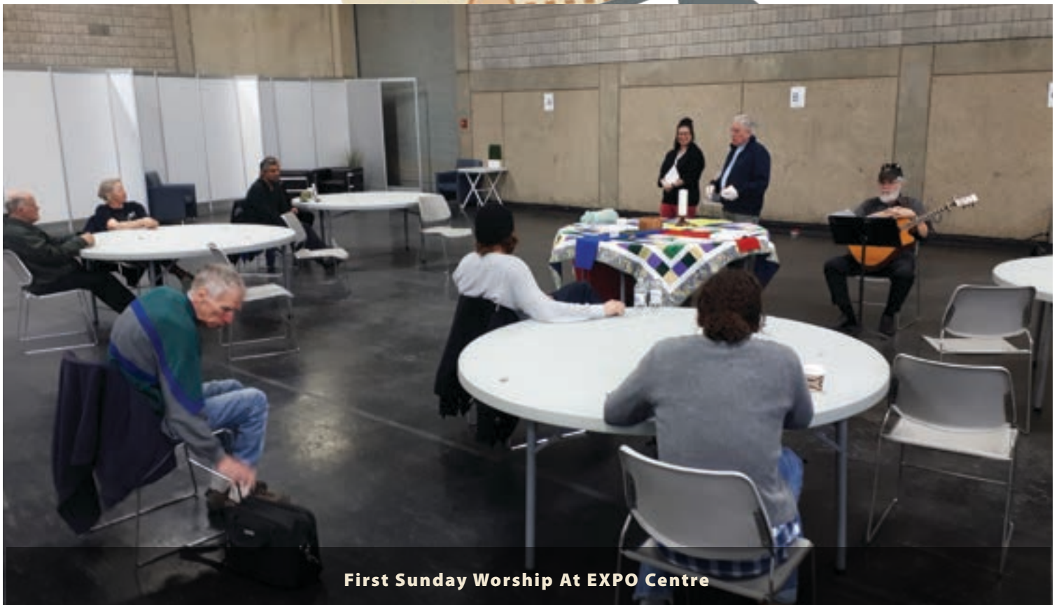
First Sunday Worship At EXPO Centre