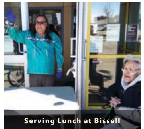
Serving Lunch at Bissell