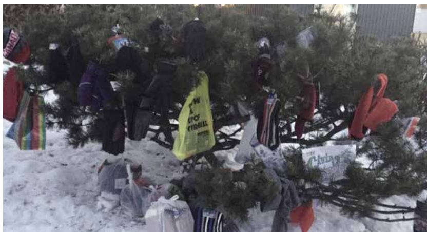
The Giving Tree Filled With Gifts