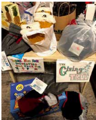
The Giving Tree Gifts