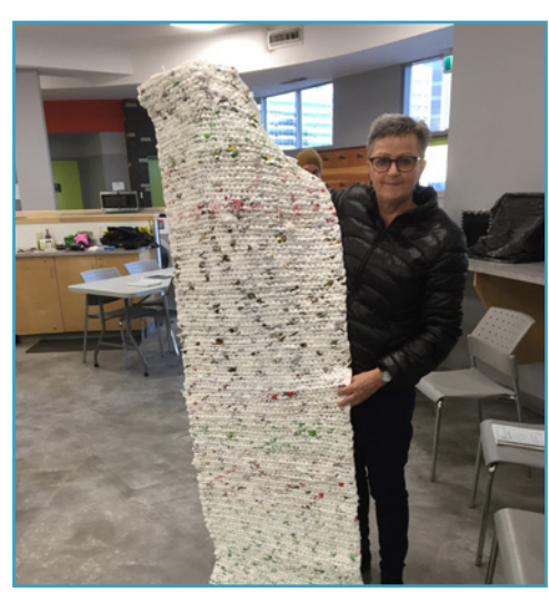
SLEEPING MAT MADE FROM PLASTIC BAGS FOR LIVING ROUGH