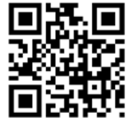
This QR code to the ICPM’s website can be scanned by a smartphone app.