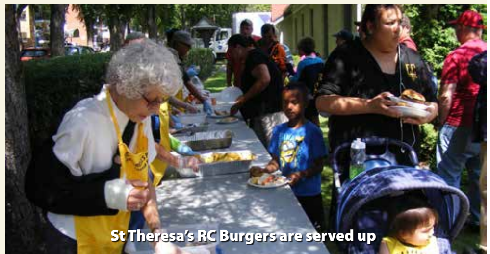
St Theresa’s RC Burgers are served up