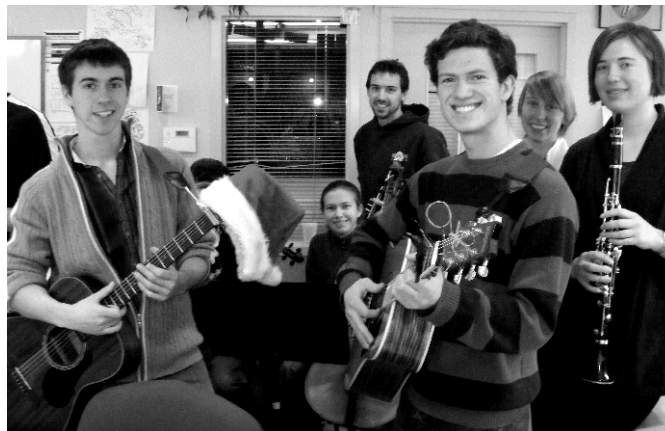
Bethel Lutheran Singers

As Glory Lutheran volunteers arrived for the Saturday sorting, one volunteer, hoping to make