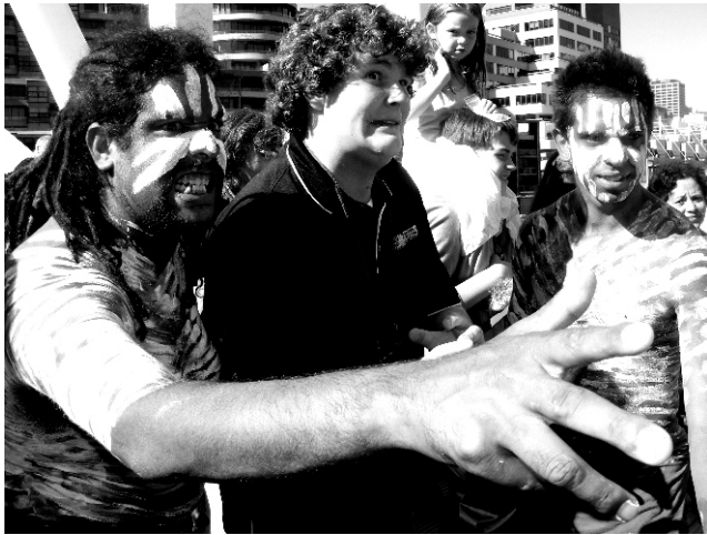
Making Friends in Melbourne

As I settle back in the comfort of my seat, the gigantic 747 winged us over the vast Pacific Ocean visible some 1000's of feet below. We had left Melbourne, Australia some three hours earlier in the brightness of a noon day sun. Now as we surfed the International Date Line, we plunged into a darkening night. I had left the land of didgeridoos, koala and kangaroos. I have time to reflect on the seven wonderful days of the Parliament of the World's Religions in Melbourne Australia, December 3-9, 2009.