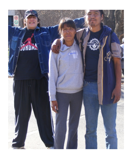
Life on the Street

Quote from the Sunday lunch coordinator's desk: "I believe that the "After the lunch is Over" get together in the fall helps our lunch program reach a higher level of communication between ICPM and the participating churches and groups. All feed back is constructive and that is what we achieve at this get together.