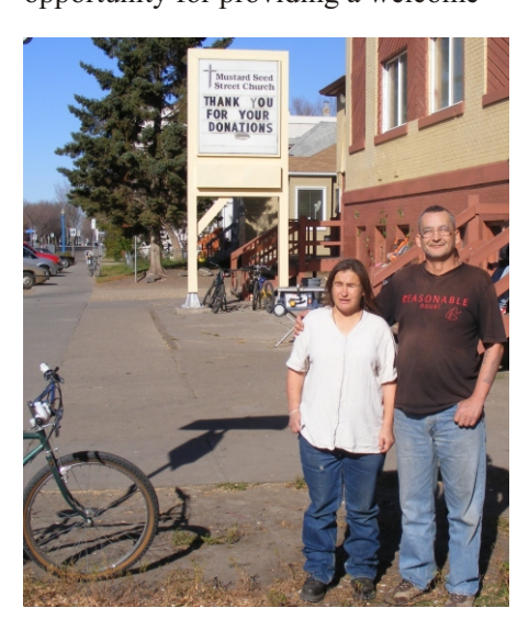
Friends of ICPM

Congregations who have joined with ICPM in providing the Sunday brunches and sharing a time of Sunday worship with the Community of Emmanuel can make a unique contribution to Welcome Home. Members of these congregations have already been introduced to some of Edmonton's homeless men and women in face to face encounters in the context of 96 Street in the inner city. "Welcome Home" provides the opportunity for providing a welcome