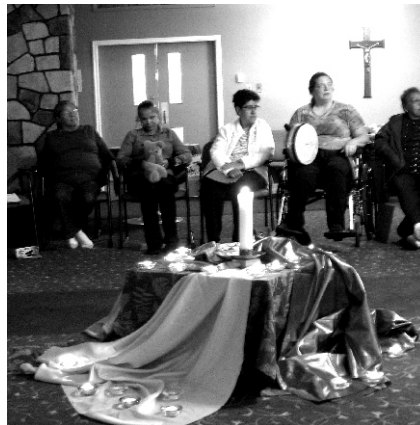
A prayer/reflection time on Saturday evening was part of the weekend program.