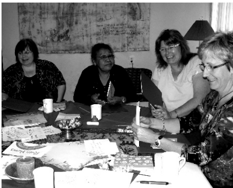
Twenty-three enthusiastic women gathered for crafts, relaxation and fellowship at the Star of the North Retreat Centre.